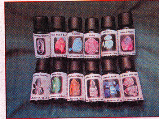
The first dozen essences.

I am very blessed and have much gratitude to have had these beautiful gem essences come into my life. I invite you to try these essences and bring more unconditional love and light into your daily experiences, creating your personal "Heaven on Earth." Have fun and enjoy the journey!